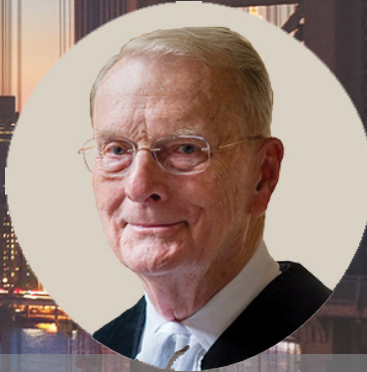
The Honorable Charles N. Brower Twenty Essex